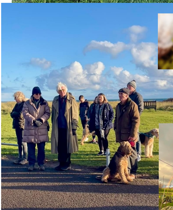
Rainbows in Easthaven on Remembrance Sunday