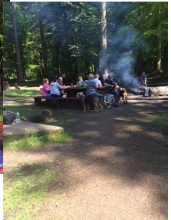
Photographs from previous club barbeque at Templeton Woods.